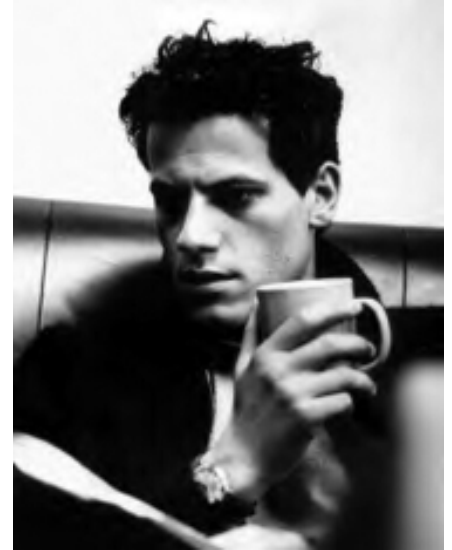
Undated Family Photo. By Permission