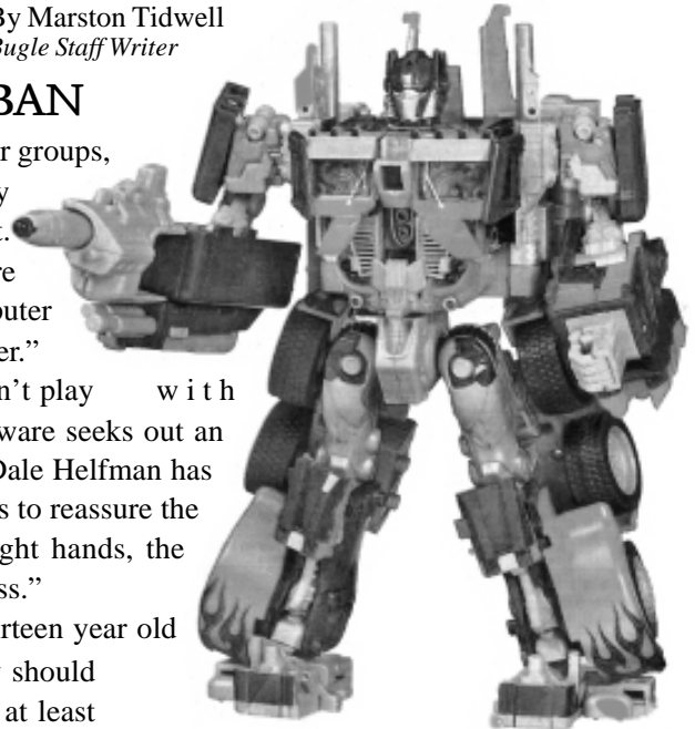
Deathbot 3000 prepares to fire.

be shot in the eye by a robot, so I will bring a petition to the Assembly to force a recall of this insidious and dangerous weapon that