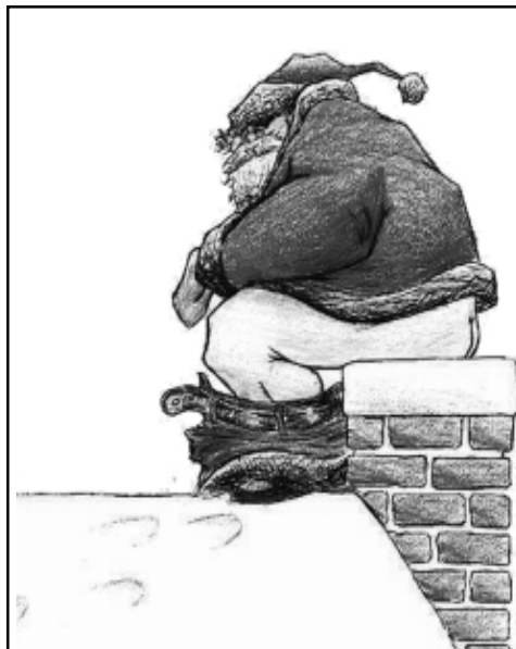
When you've been really, really, really bad.