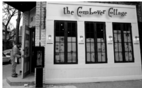
Shop Caters to Follicle Challenged

A look inside the salon on any given day