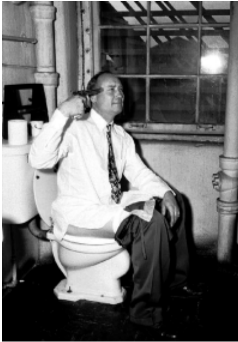
Realistic Re-enactment

AP__The North Bergen Coroner's Office has released some disturbing statistics concerning local suicides. It appears that over a dozen middle-aged men have taken their lives in the last 60 days while using the restrooms at various Gypstowner restaurants. In each case, the decedent had recently purchased and listened to the new comedy album from Richard Belzer, "This'll Kill You".