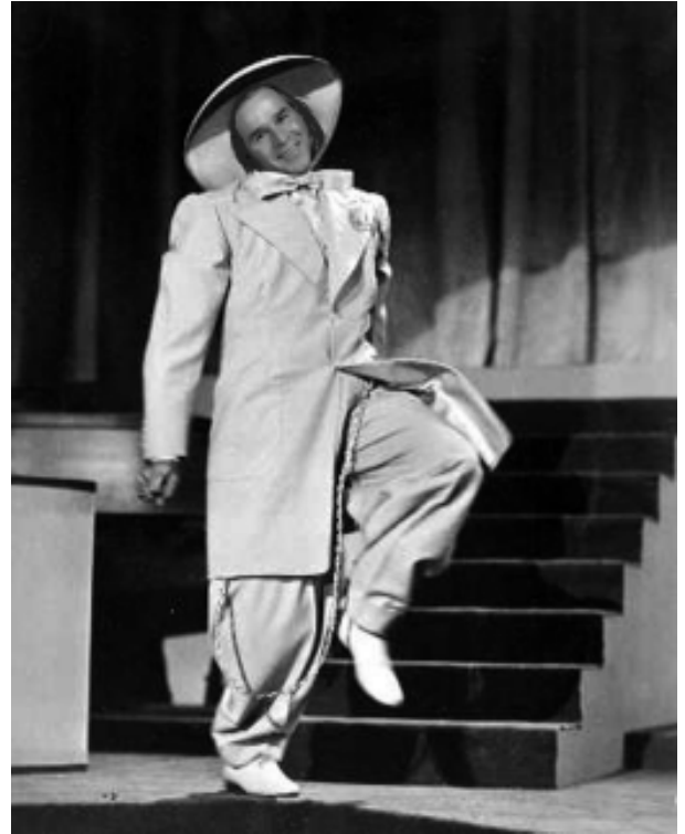
Last Song and Dance