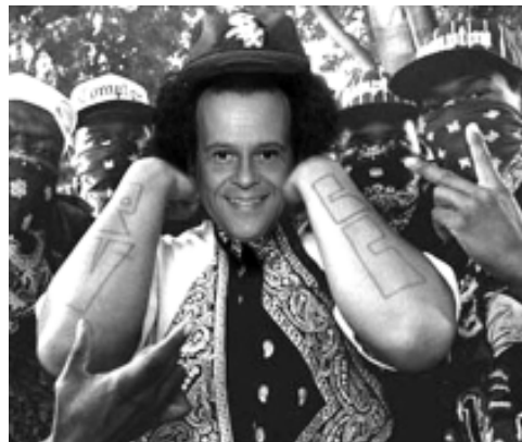
Simmons and his Homies

In an impromptu public appearance yesterday, the reclusive Richard Simmons and several disguised gang members gathered