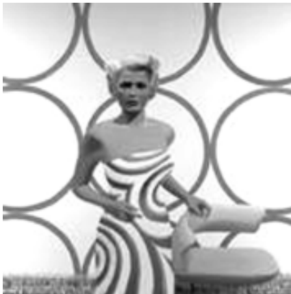
Rochester's New Installation

[see Too much Time on Her Hands? , pg. A5]