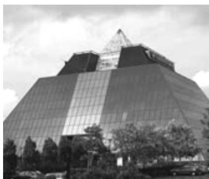
Pyramid of Solutions

He perfected Bifurcation Analysis of Tunneling Theory. No one really knew what exactly he did. A21