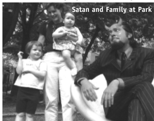
Satan and Family at Park