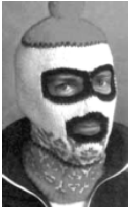
Target of Legislation

Wednesday night, in a contentious midnight session, the State Legislature passed Senate Bill 331, otherwise known as the "Ski Mask Statutes".