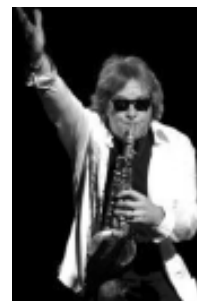
Eddie Money UPI

For further information on donations to the Brosnan Help Fund, call 800 562-0100 or contribute directly online at cash4bond@spies.com.