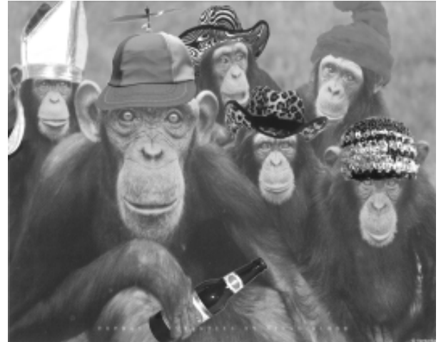
Chimps at Hat 'N Beer Party

At that moment, armed security officers moved in and whisked "God" off the stage.